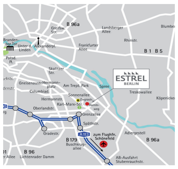
Estrel Hotel Berlin, Sonnenallee 225, 12057 Berlin